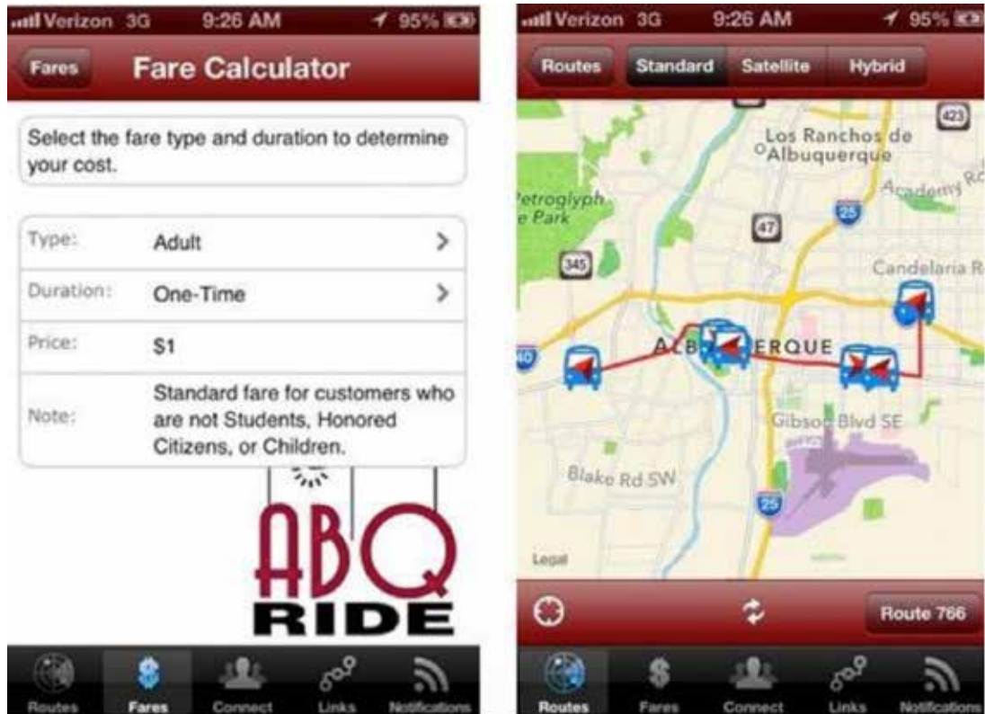
Fig. 2 Screenshots of ABQ Ride, an iOS application using real-time data from the City of Albuquerque data to track bus location, calculate fares and learn about New Mexico public transportation. Learn more at: http://www.cabq.gov/abq-apps/city-apps-listing/abq-ride

Consumable, web-ready data is the lifeblood of any hackathon, making it important to consider what types of information would be most useful and interesting to the public. [See Fig. 2] It is important to communicate that the utility of the information might not be immediately apparent. Novel uses for data can present