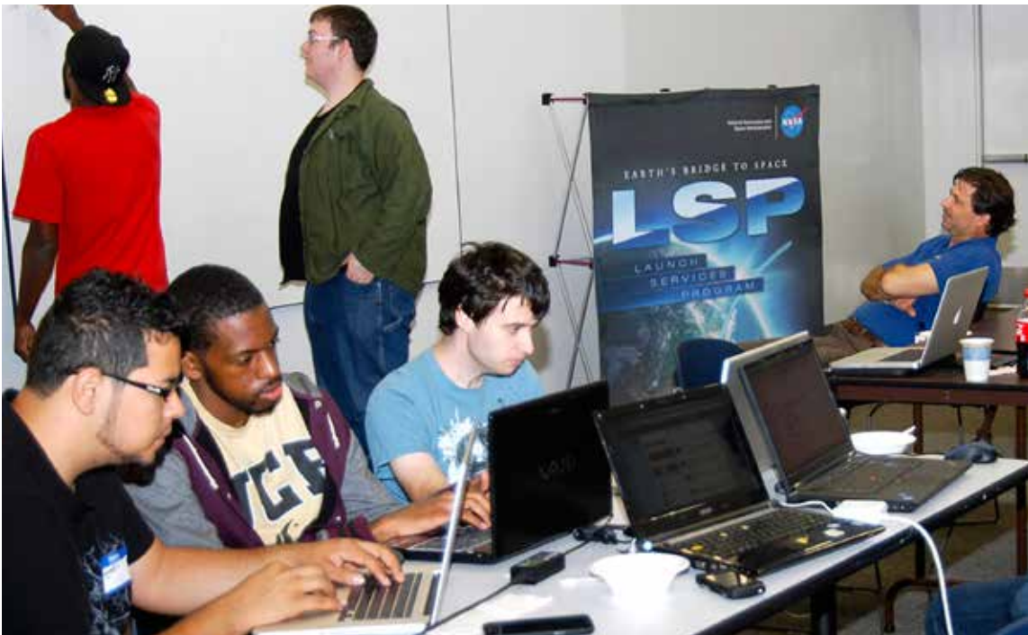
Fig. 1 Participants at the Kennedy Space Center branch of the 2013 Space Apps Challenge. Learn more at: http://spaceapps.tumblr.com .

persistent problems in innovative ways. [See Fig. 1] For example, the Pineapple Project 6 confronted the issue of food scarcity in developing countries by offering an SMS tool and smartphone app to assist farmers. These tools aim to integrate information on crop markets, growing conditions and local resources “to make their yields as profitable and efficient as possible.” 7 This ongoing project was the winner of “Most Disruptive” at the 2012 International Space Apps Challenge, a premiere hackathon event organized by NASA. In the 2013 event, the winner for “Galactic Impact” was The Greener City Project. 8 This application seeks to enrich “NASA satellite climate data with crowd-sourced micro-climate data; in effect, providing higher resolution